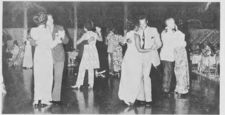
Guests have the occasion to spin around the dance floor. Huespednan tin ocasion pa baila ariba pista di baile.

Aruba Rotary is host to twenty students from different nationalities as part of the "World Understanding Week" commemorated by the International Rotary on October 16.